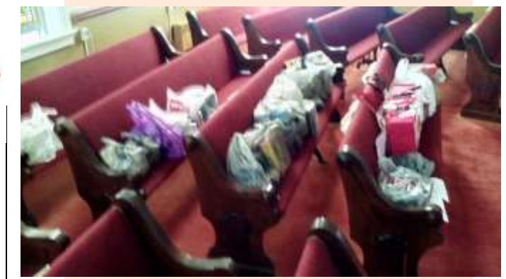
FILL A PEW Program at the Human Svc. Ctr. During the month of August. Thank you for your support!