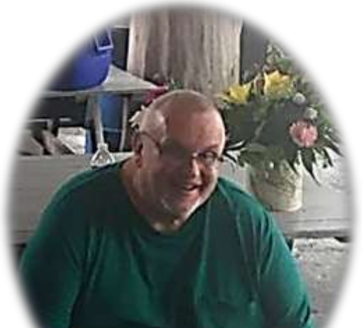
However, the rain didn't stop the fun, food and friends of Salem from having a great time!